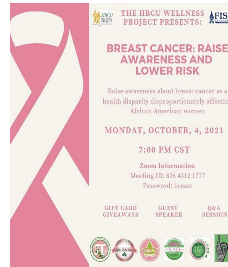
Figure 1. "Breast Cancer: Raise Awareness and Lower Risk" Event Flyer